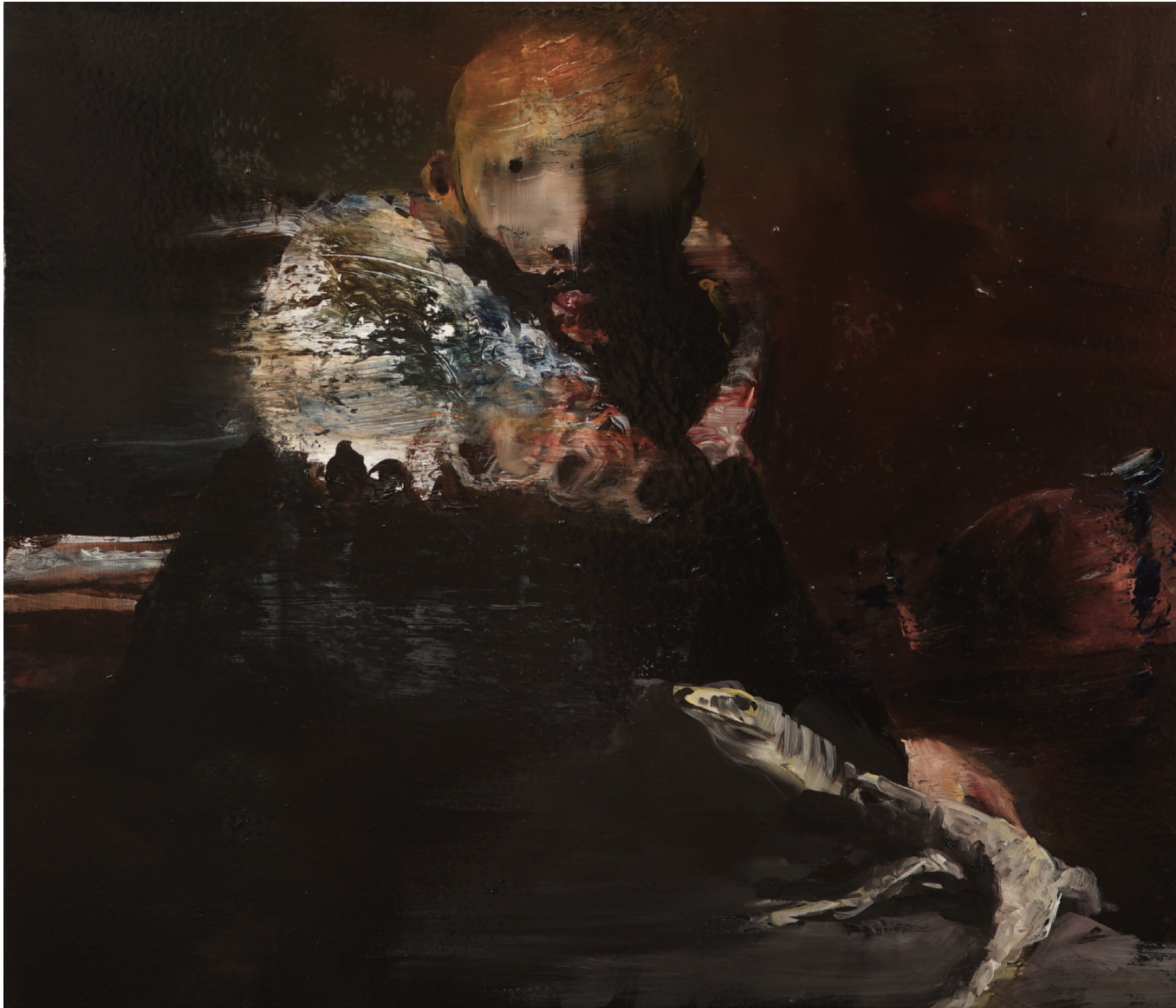
“Il sussurro della lucertola” The whisper of the lizard.