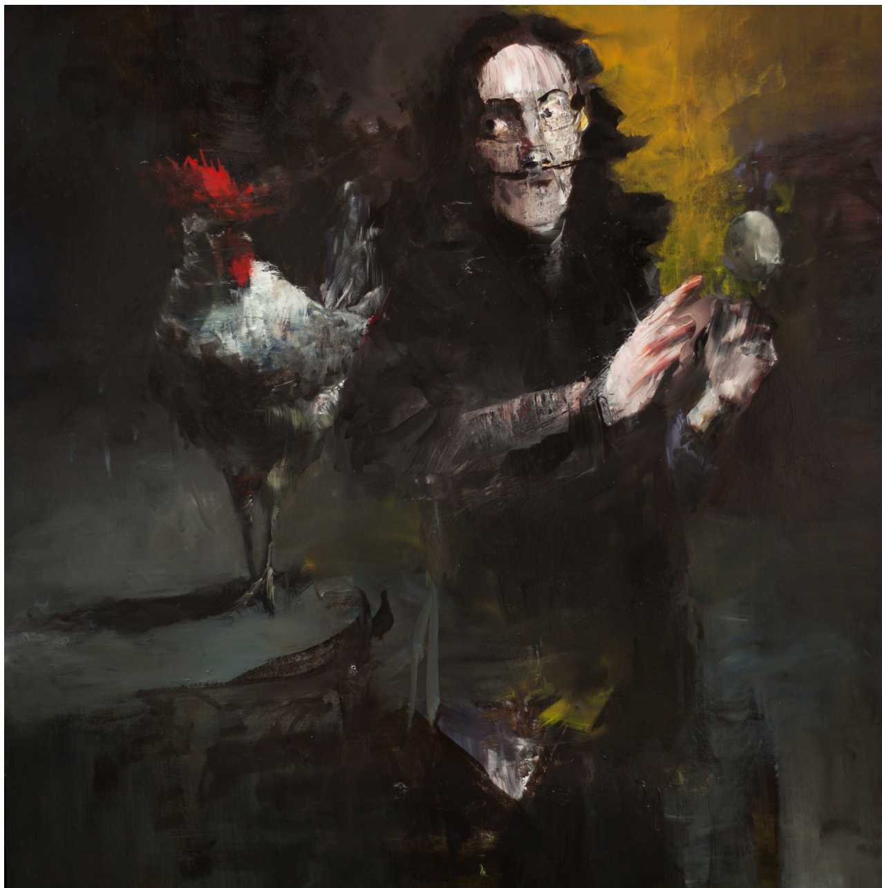
“Dalí spiega il surrealismo ad un gallo” Dalí explains surrealism to a rooster