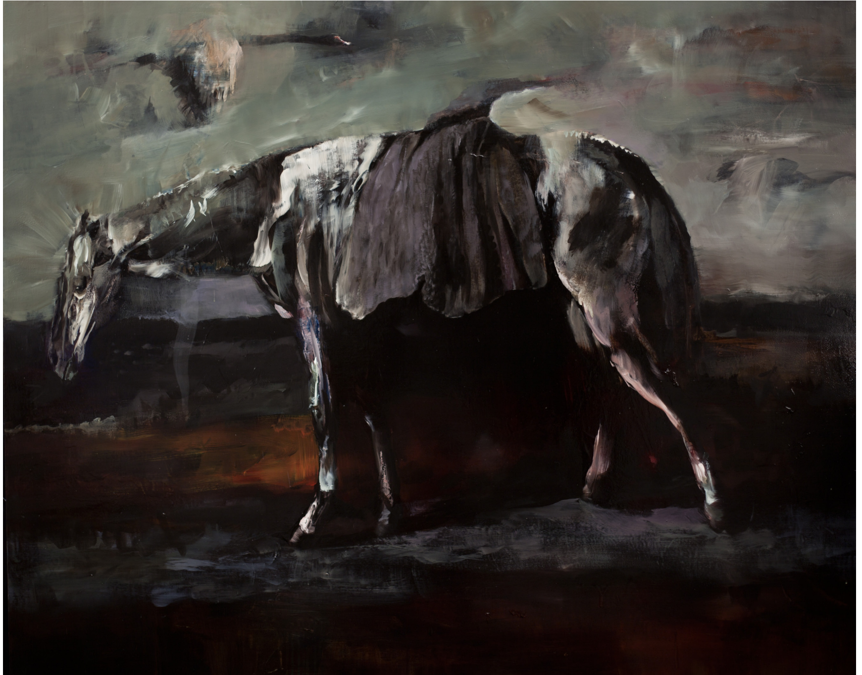
"Terzo passaggio orizzontale. Cavalcando senza corpo" Third horizontal passage. Riding without body 2019, cm 70x60, oil on canvas.