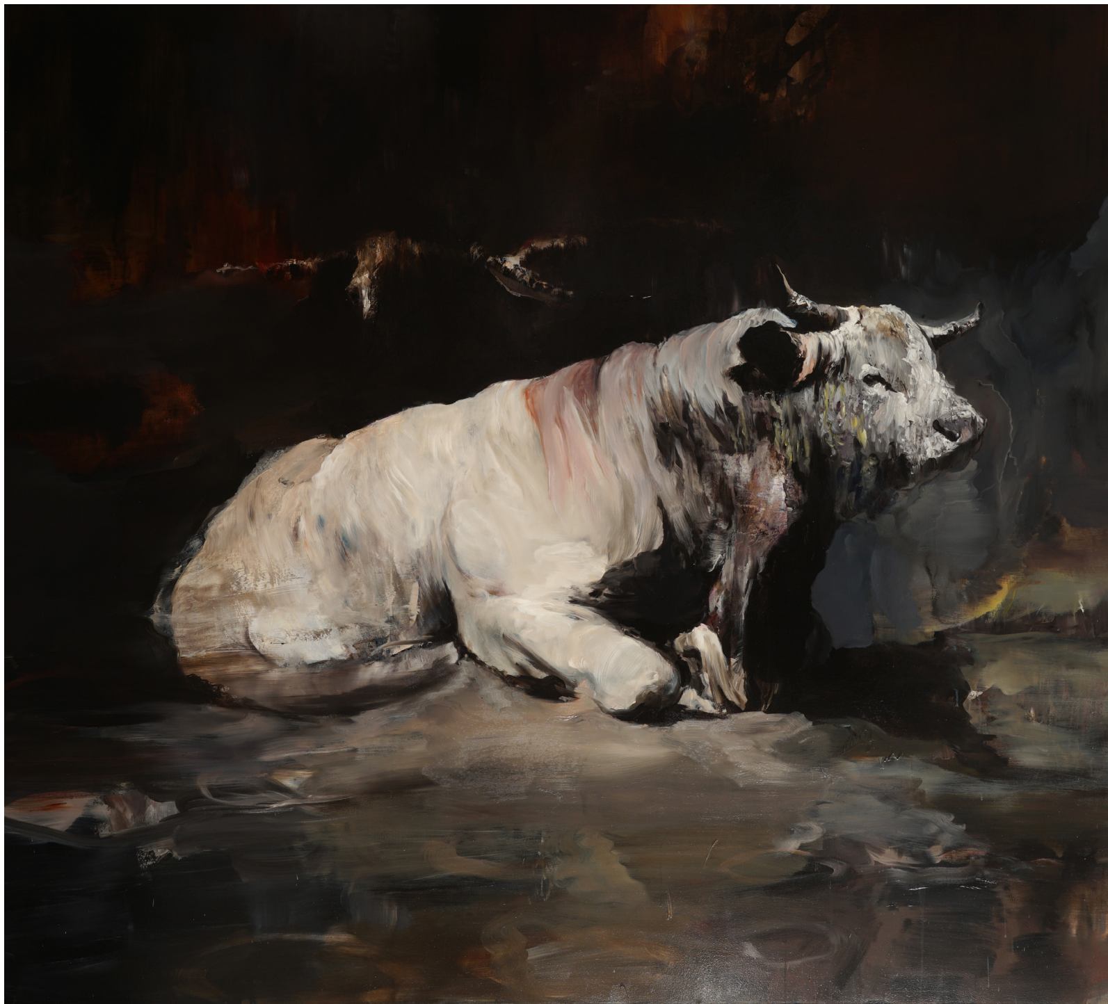
"Metamorphosis of Zeus"